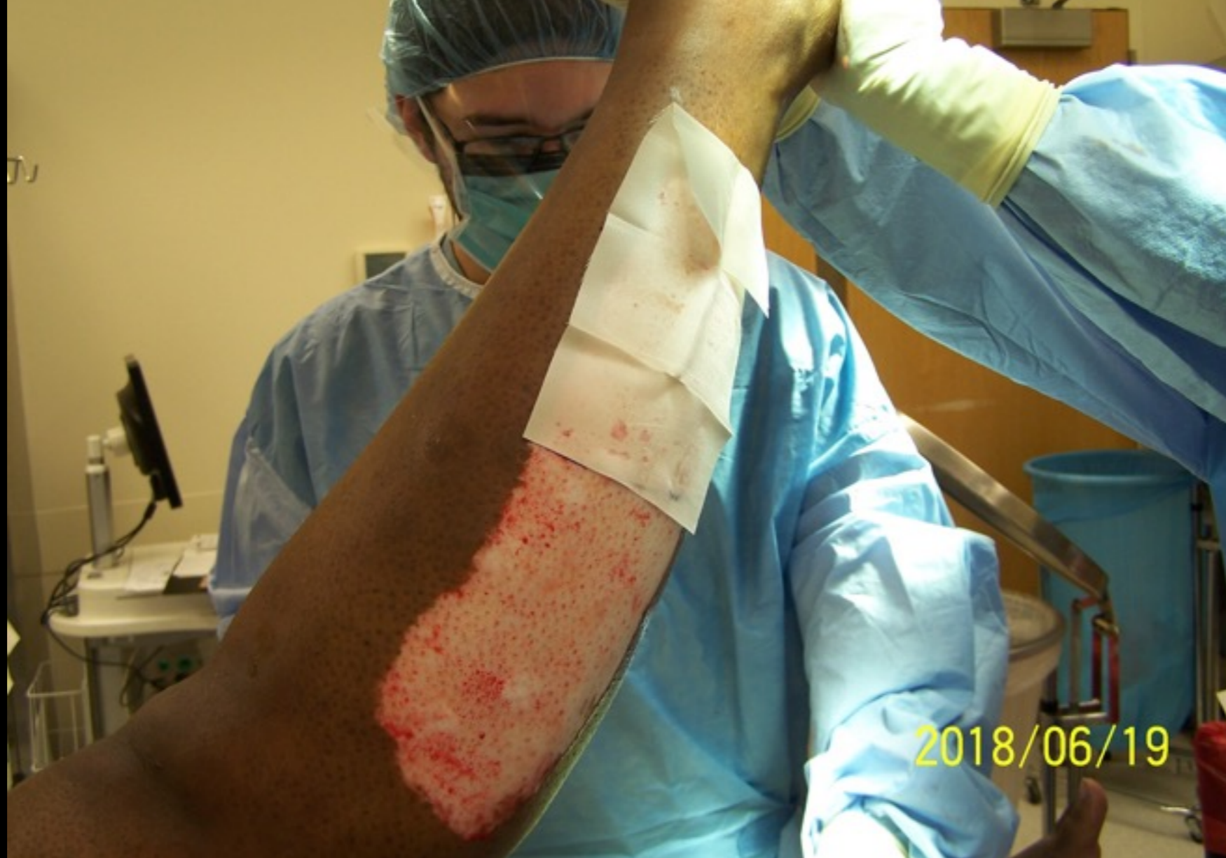
BlodStop iX applied to Donor site