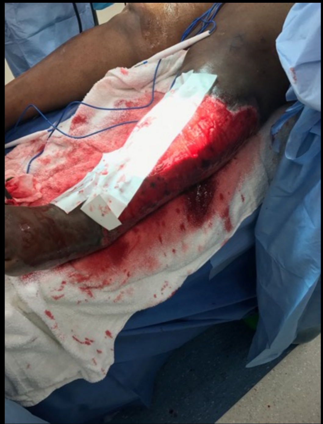
Left Lower Extremity post debridement with BloodStop iX applied