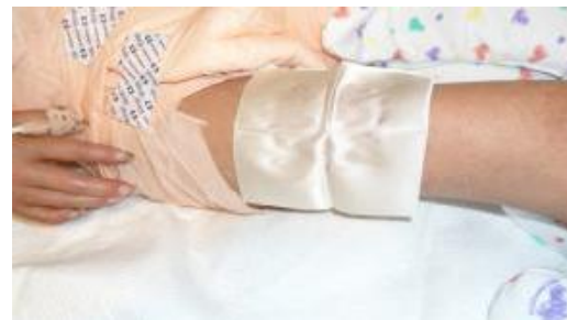
Covered with BloodSTOP iX