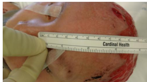
New tissue grew, healing in process