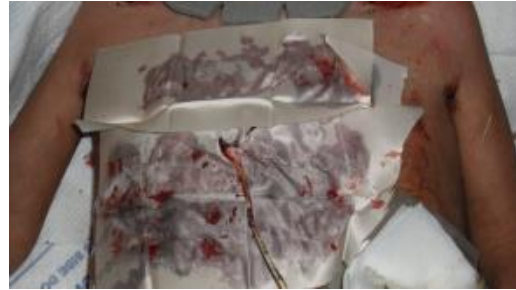
Covered with BloodSTOP iX