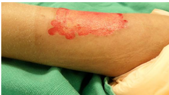
New tissue grew, healing in process