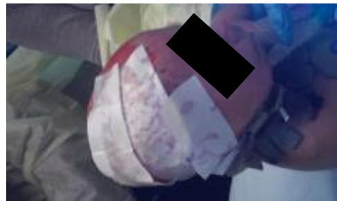
Covered with BloodSTOP iX