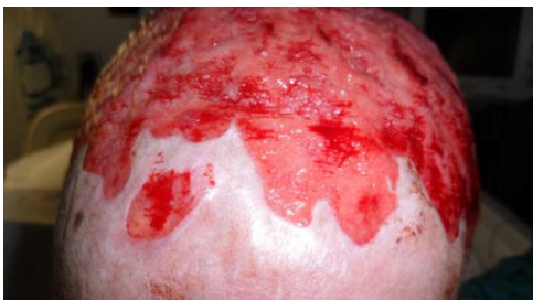
New tissue grew, healing in process