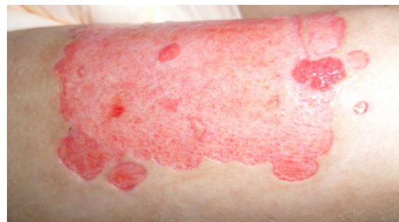
New tissue grew, healing in process